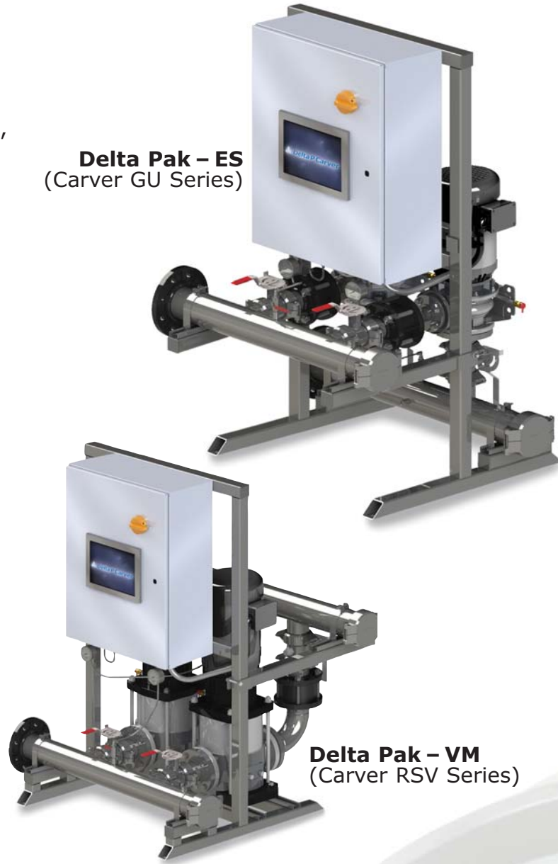
Delta Pak – VM (Carver RSV Series)